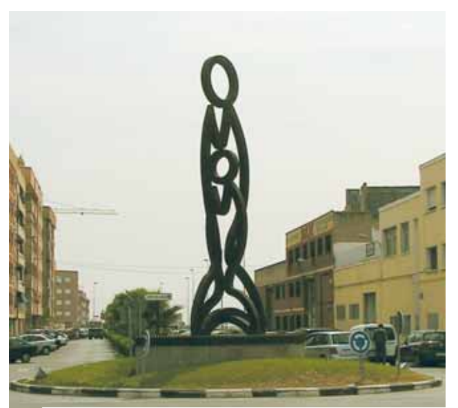
Commemorative sculpture of the Miracle in the city-center