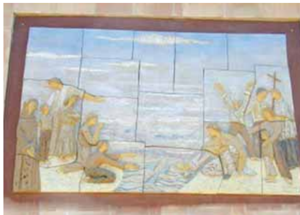
Mosaic on the exterior of the Church