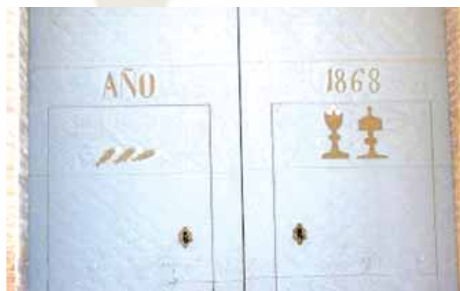
The fish in the Miracle are represented on door of the entrance to the Church