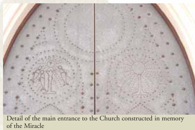
Detail of the main entrance to the Church constructed in memory of the Miracle