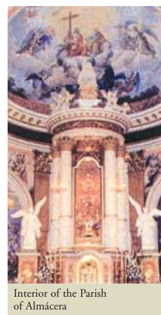
Interior of the Parish of Almácer