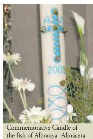
Commemorative Candle of the fish of Alboraya-Almácer