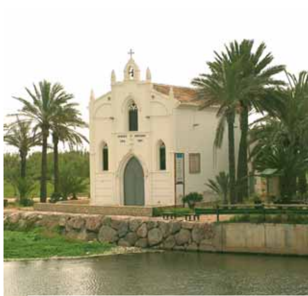
Hermitage Church in Alboraya