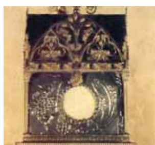
Decorative case containing the stone of the miracle, Parish of Saint Bernard