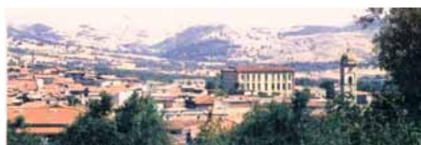
Panoramic view of Mogoro