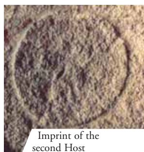
Imprint of the second Host