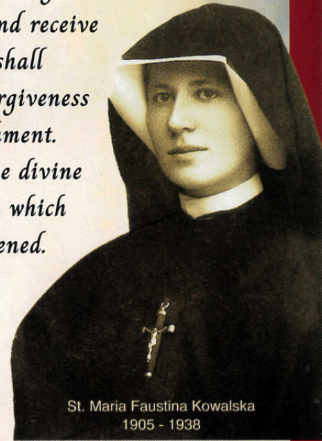
St. Maria Faustina Kowalska 1905 - 1938

“My daughter, tell the whole world about My inconceivable mercy. The soul that will go to Confession and receive Holy Communion shall obtain complete forgiveness of sins and punishment. On that day all the divine floodgates through which graces flow are opened. Let no soul fear to draw near to Me, even though its sins be as scarlet” (699).