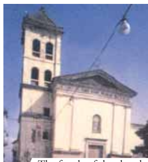
The façade of the church of San Mauro