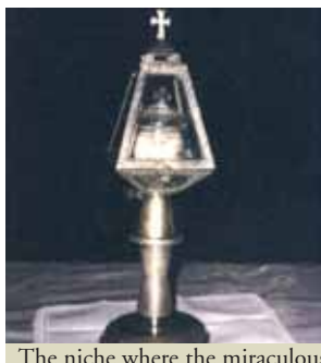
The niche where the miraculous Hosts are preserved