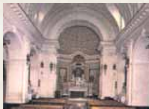
Inside of the church