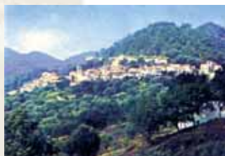
View of San Mauro la Bruca