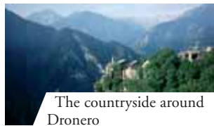
The countryside around Dronero