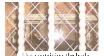
Urn containing the body of Saint Clare, Assisi