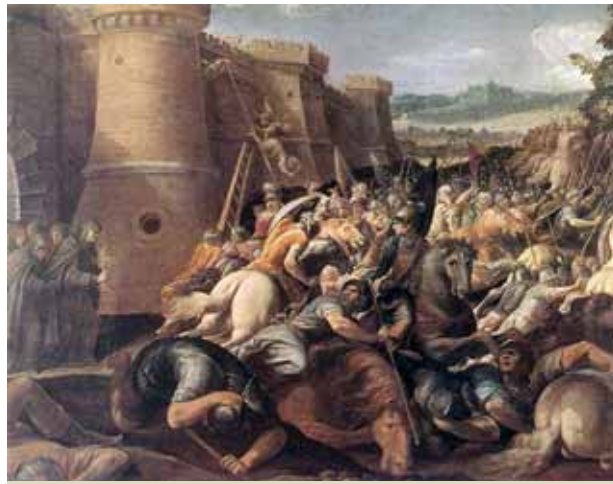
Saint Clare and the Assault on Assisi , Giuseppe Cesari (1568-1640). Hermitage Museum, St. Petersburg

The History of Saint Clare, Virgin, tells of various miracles performed by Saint Clare. There are episodes of multiplications of loaves, of bottles of oil that appeared in the convent when there was none before. But Clare performed the most famous of the miracles in 1240, on a Friday in September, in which she turned away an attack by Saracen soldiers who had broken into the convent cloister by showing them the Sacred Host.