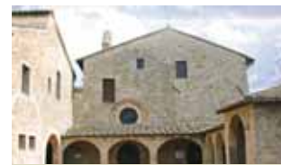
Convent of San Damiano in Assisi