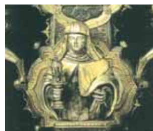
Saint Clare , detail of the great Cross of Gianfrancesco dalle Croci