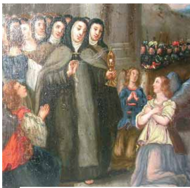
Ancient depiction of the Miracle of Saint Clare