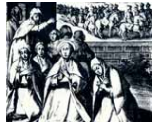
Enrico de Vroom (1587), Miracle of Saint Clare